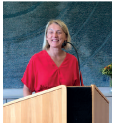
Evelyn Regner ( Vice-President of the European Parliament )