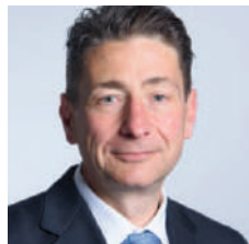
N. Forgó

Requirements: Regular attendance and active participation in class discussions (40%) and an open-book essay exam (60%).